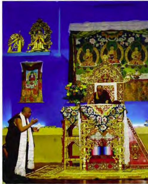
Temple blessing in July 2007

Today, more than 122,000 Tibetans remain in exile around the world—7,000 in the U.S. and Canada, including 500 in the Madison area. This population makes a place like Deer Park all the more important, not only as a home away from home for the Tibetan people, but also as a safe place to preserve, foster and celebrate their culture.